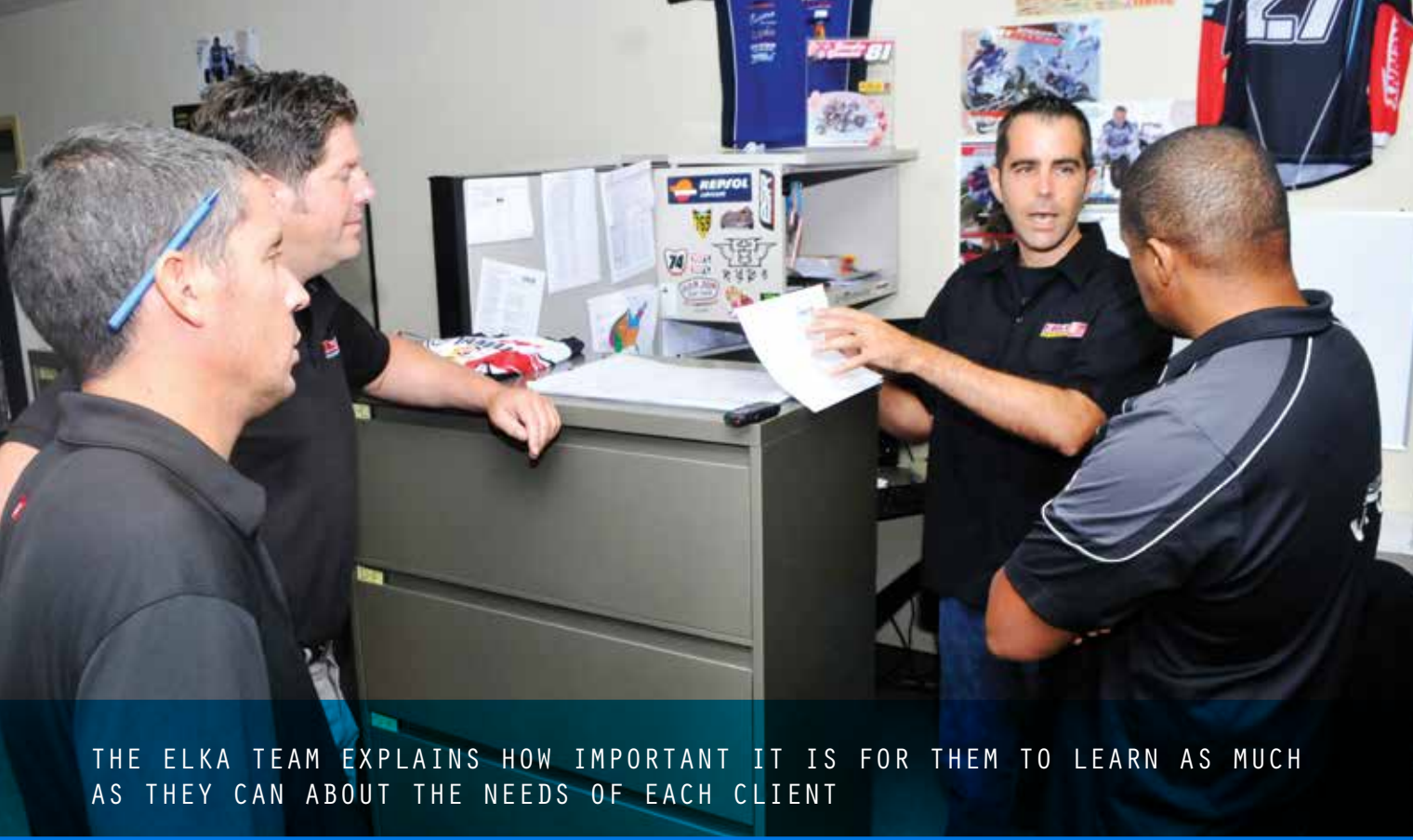
THE ELKA TEAM EXPLAINS HOW IMPORTANT IT IS FOR THEM TO LEARN AS MUCH AS THEY CAN ABOUT THE NEEDS OF EACH CLIENT