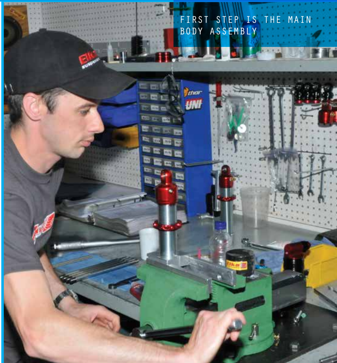
FIRST STEP IS THE MAIN BODY ASSEMBLY