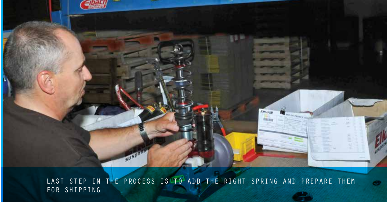
LAST STEP IN THE PROCESS IS TO ADD THE RIGHT SPRING AND PREPARE THEM FOR SHIPPING