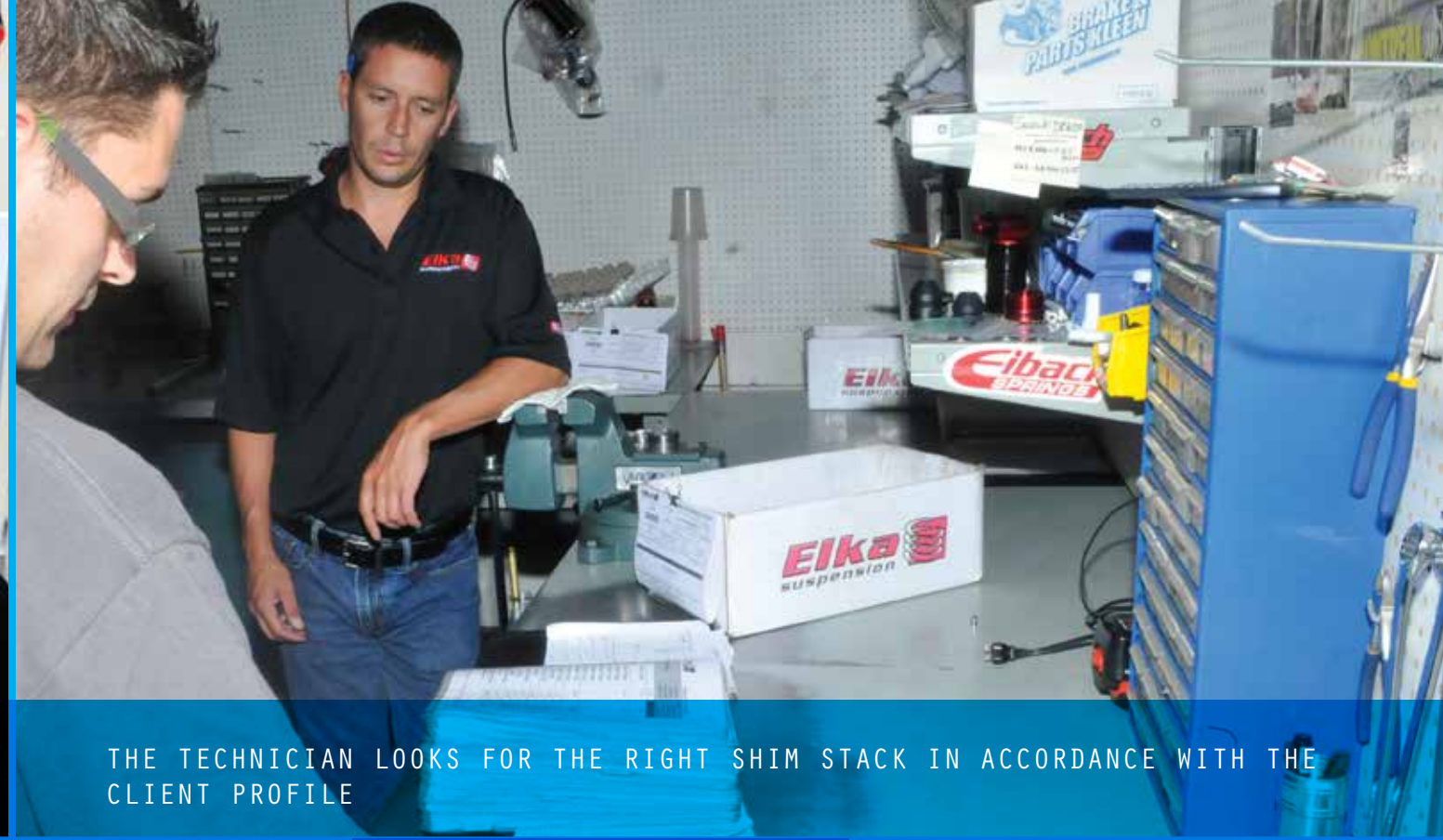
THE TECHNICIAN LOOKS FOR THE RIGHT SHIM STACK IN ACCORDANCE WITH THE CLIENT PROFILE